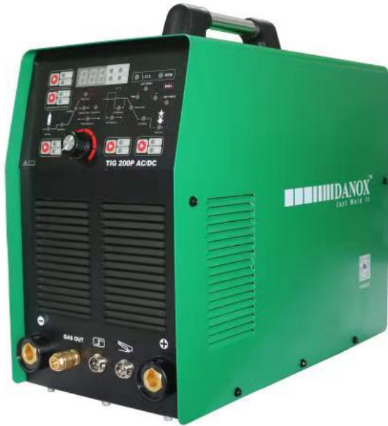
Comes with Pulse function